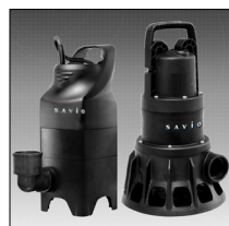
Water Master Pumps™