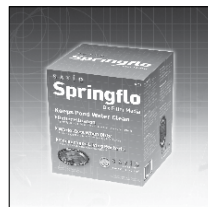
Springflo Bio Media™