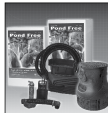
Pond Free® Packages