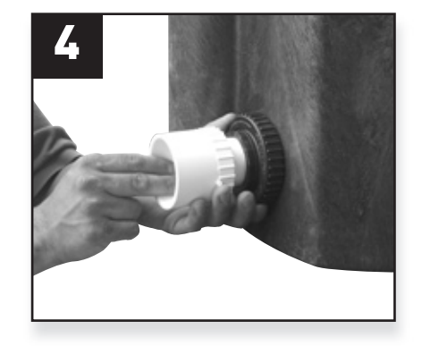
Apply teflon tape to outer threads of male adapter and insert into bulkhead