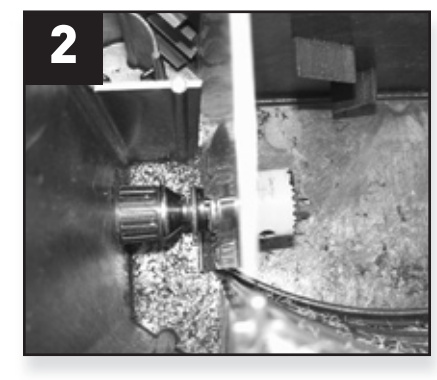
Drill 1-7/8" hole in inner baffle shield.