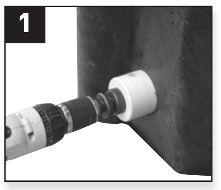
Drill a 2-5/8" hole in lower housing of the Skimmerfilter<sup>™</sup> for bulkhead fitting. Use existing marks for placement.