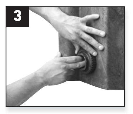
Insert bulkhead. Attach bulkhead with locknut on the outside of Skimmerfilter<sup>™</sup> and tighten with channel locks.