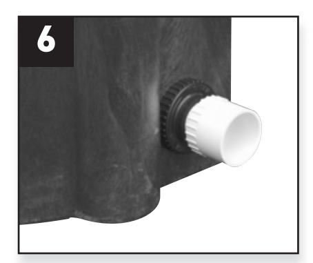
An external pump may now be connected to male adapter using PVC.