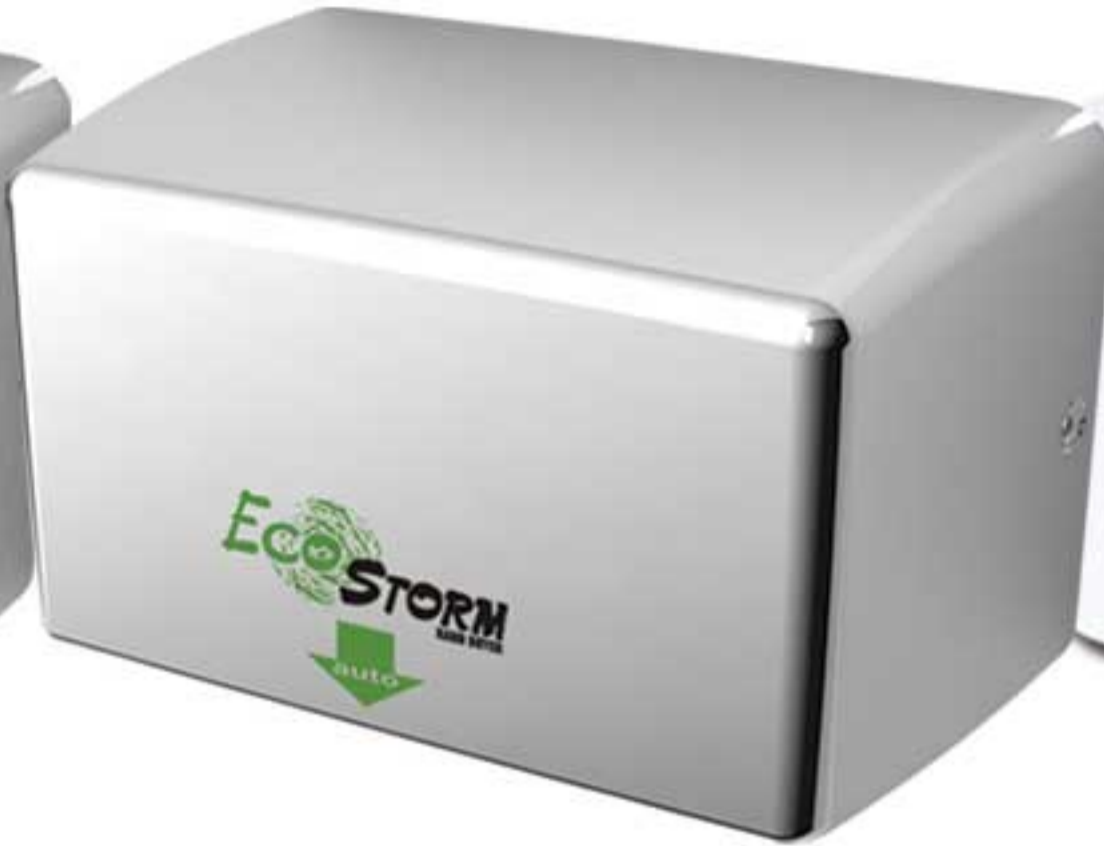
HD 940 XS