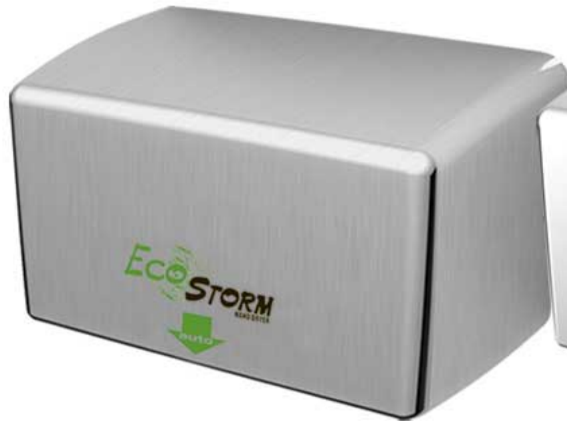
HD 940 SS