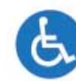
HD 945 SS Recessed EcoStorm (ADA Compliant)