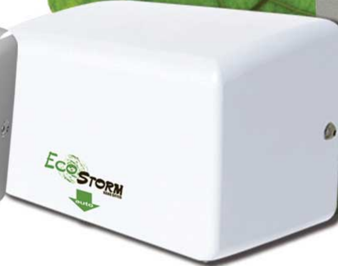
HD 940 WH