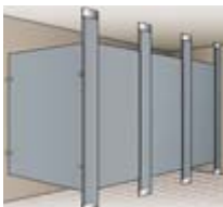
Floor to Ceiling