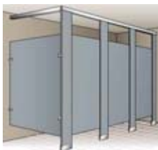
Head Rail Braced