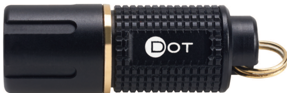
The Dot is the smallest, full function, lithium powered, LED light in the world.