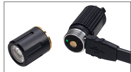
An LED indicator turns from flashing red to solid green when the Dot is fully charged.