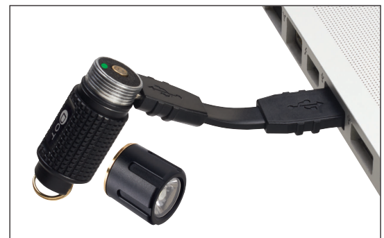
The included Micro Flex allows Dot charging with any computer.