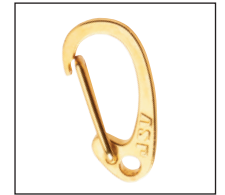
Detachable Clips allow attachment and convenient removal of the Dot.