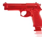
Beretta 92 w/ Drop-Out Magazine 07394