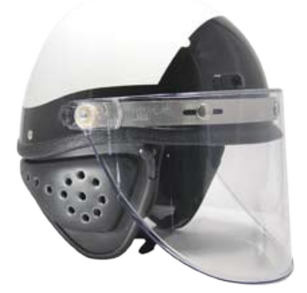
S-5005G SR Shield