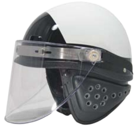
S-5005G E Shield