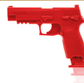
M17 w/ Drop-Out Magazines (2) 07369