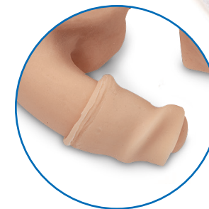
Removable foreskin (male)