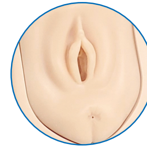
Soft touch silicone skin