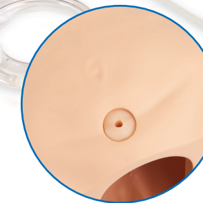
Suprapubic catheterization training