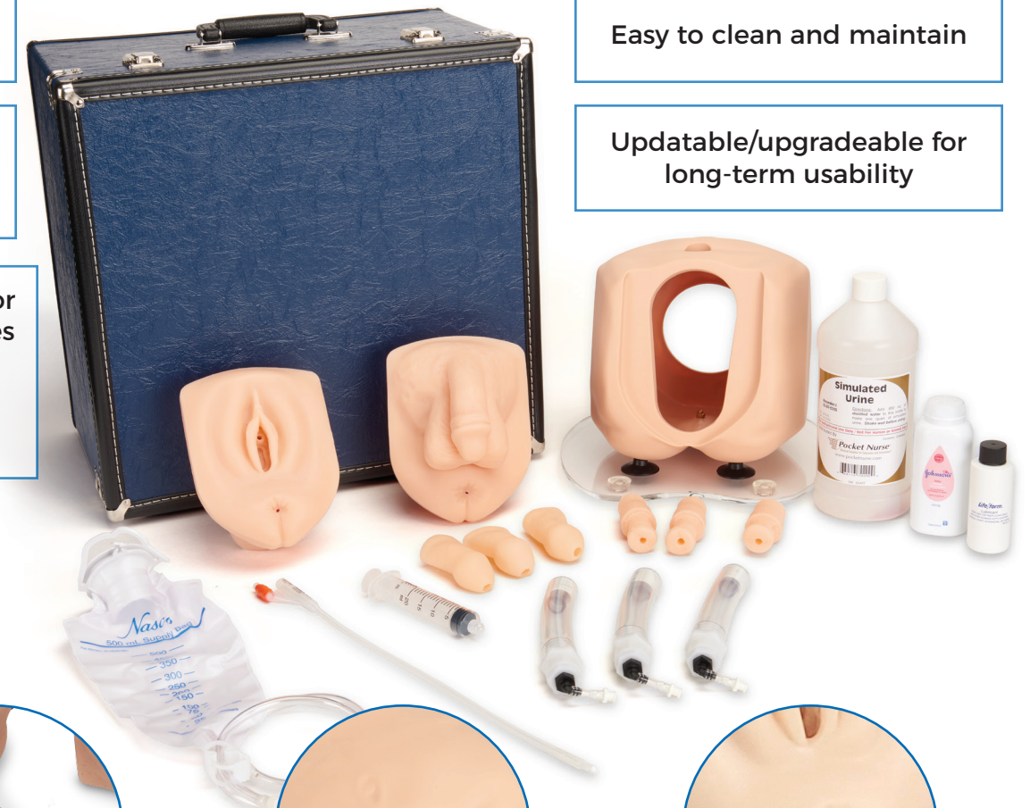
Updatable/upgradeable for long-term usability