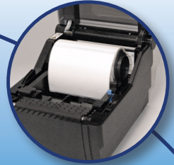
Drop - Load - Go Media Bin