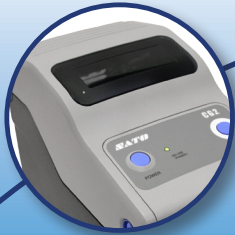
Anti-Microbial Casing (CG2 only)