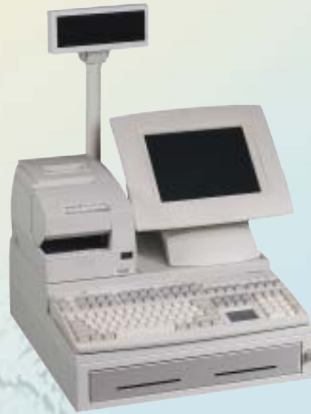
Platform System II with Heritage 240 drawer