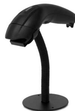
Shown w/optional stand