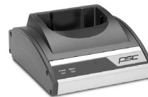
Falcon® Dock also available