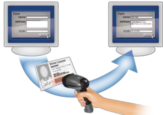
Automatically populate electronic forms in a single scan