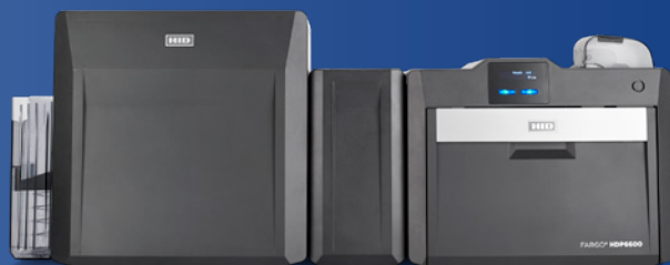
Dual-sided printer/encoder with optional lamination