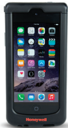
SL22 iPod® touch