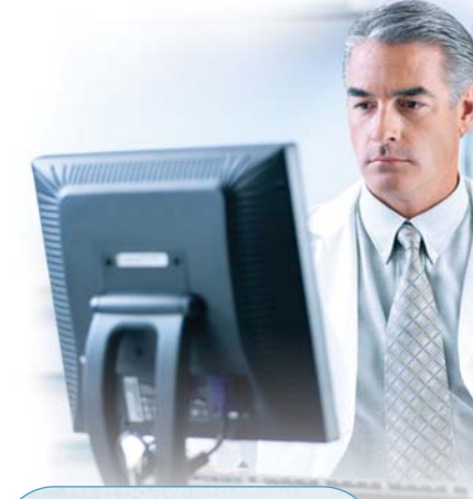
Transfer test data and patient information to individual patient records in your EMR for permanent storage