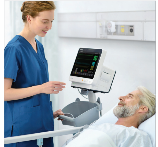
Expandable Minitrend Window