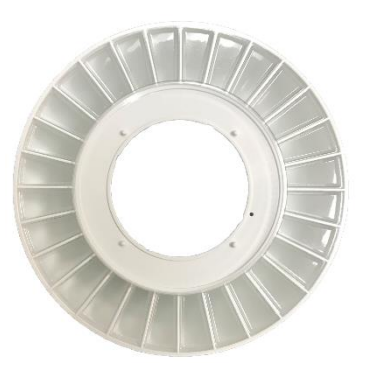
Medication Tray (2) Item 992040