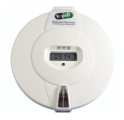
Locked Automatic Pill Dispenser (1) Item 992020 (clear lid)/992030 (solid lid)