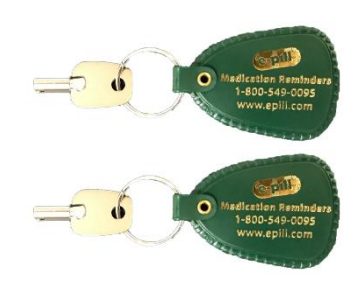
Keys (2) Item 991022