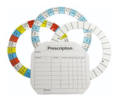
Dosage Template Set (1) Item 991038