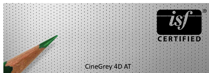
CineGrey 4D AT