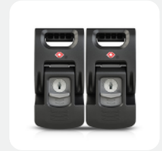
TSA Powerclaw Latch Retrofit Kit