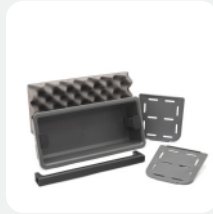
Tray & Rigid Dividers