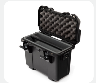
Tray & Rigid Dividers