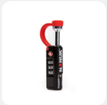
Nanuk TSA Padlock