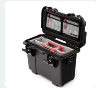
Pro Photo Kit