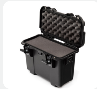
Cubed Foam & Eggshell