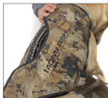
Fitted with Handle and Leash Loop Exposed