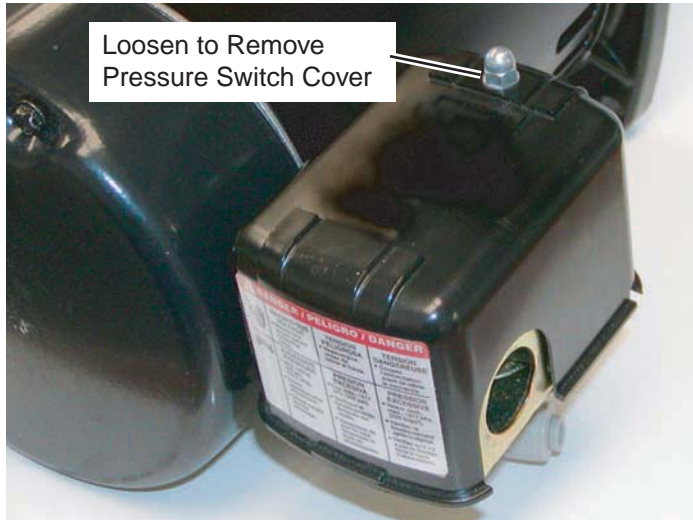
Figure 1: Pressure Switch Location

The starting and stopping of the pump is controlled by the pressure switch.