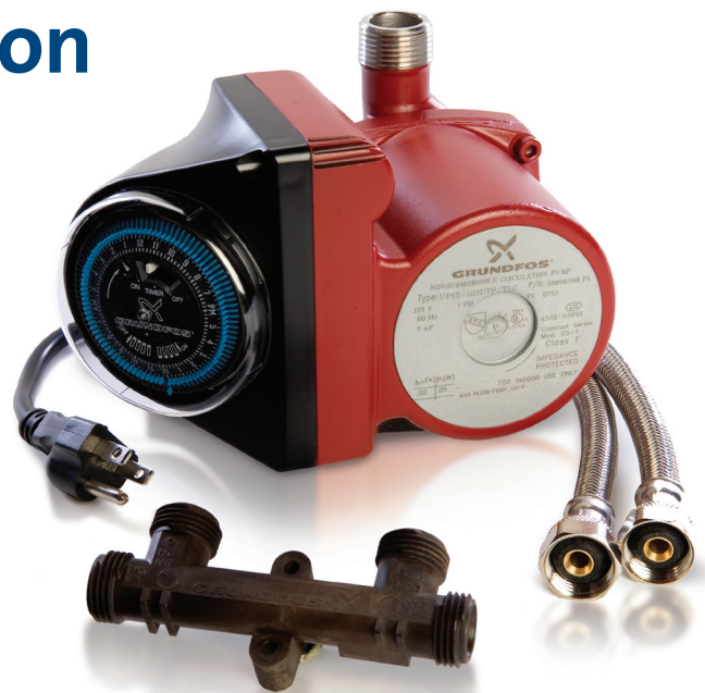
UP 15-10 SU7P TLC (Part# 595916) Pump, valve, line-cord, and (2) S.S. flex hoses.

For more information about the Grundfos Comfort System go to: