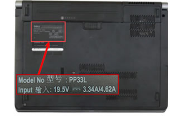
Step 1a: Refer to the label on AC adapter for your notebook - to check the "Output Voltage"