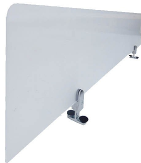
Double Sided Bracket (CLIP2)