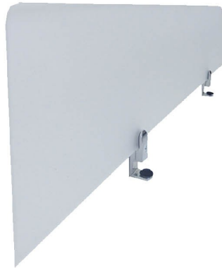
Single Sided Bracket (CLIP1)