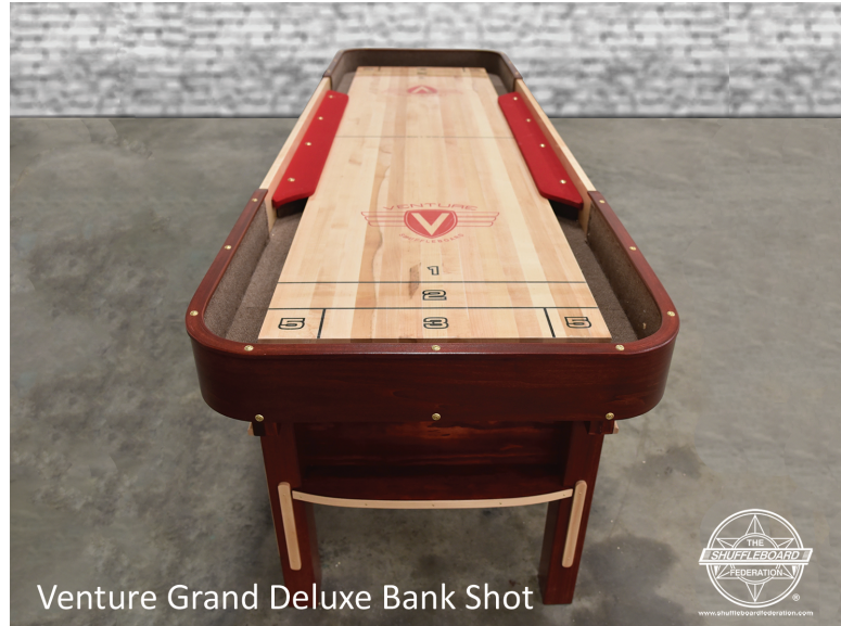
Venture Grand Deluxe Bank Shot