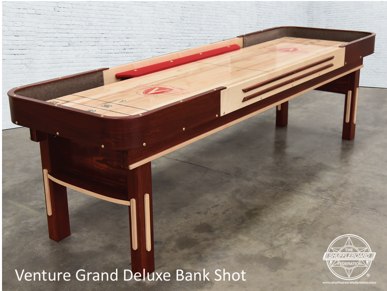
Venture Grand Deluxe Bank Shot

WWW.SHUFFLEBOARDFEDERATION.COM - INFO@SHUFFLEBOARDFEDERATION.COM