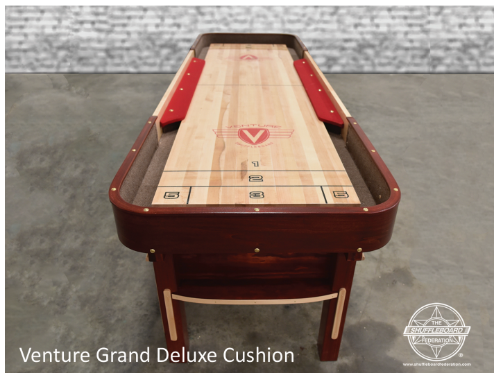
Venture Grand Deluxe Cushion