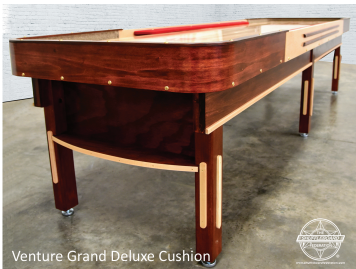
Venture Grand Deluxe Cushion

WWW.SHUFFLEBOARDFEDERATION.COM - INFO@SHUFFLEBOARDFEDERATION.COM