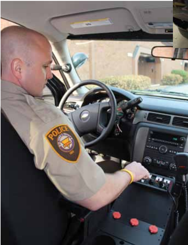
Operating the Banshee from the primary siren control head.

Code 3 C3100 Speakers are now capable of producing low frequency tones. At 6.3" x 6.3" x 3" they fit in a variety of locations.