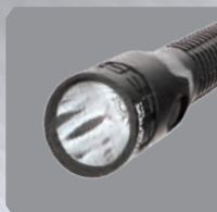
High-efficiency deep parabolic reflector