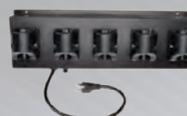
Five bank charger