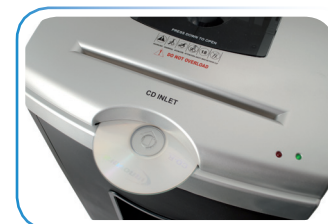
Dedicated CD infeed slot