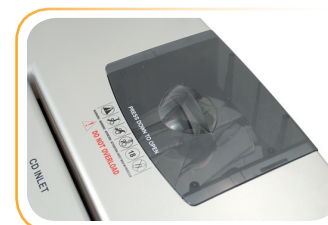
Dedicated CD waste bin, separate from paper shreds