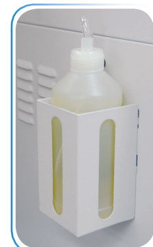
Optional EvenFlow™ Automatic Oiling System

*Capacity varies depending on paper and power supply