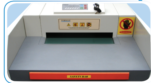
Large infeed deck with conveyor belt feeder and safety bar for immediate shut down

Keeping the 8804 Series in top condition is easy to do. With the Auto Cleaning function, clearing the blades of shredding debris is as simple as pressing Reverse on the control panel. Plus, the EvenFlow™ Automatic Oiling System lubricates the all-steel cutting blades, helping to keep the shredder in peak condition for optimal efficiency.