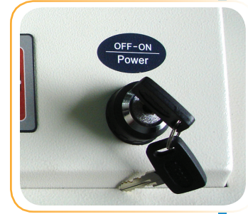
Keyed On/Off switch

The 8804 Series offers unmatched automated features through its LED control panel. The easy-to-read Load Indicator assists operators in determining how close they are to the maximum shred capacity to avoid jams and provide optimal efficiency. Indicators also notify operators when the waste bin is full or the cabinet door is open. Operators can select from two modes of operation: Auto Start/Stop or Manual. Auto Start/Stop mode utilizes optical sensors which detect paper and start/stop operation automatically. Manual mode provides non-stop operation for shredding small sized paper or films.