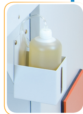
EvenFlow™ Oiling System Reservoir Bottle

Safety is an important component in the 8804 Series design and engineering. A large 18"-wide safety bar is located in front of the conveyor belt system and will shut down the shredder instantly when pressed. A safety key and lock system is also included to ensure the shredder is operated only by authorized staff.