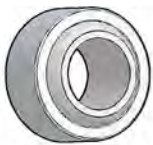
960 - 3/4 BEARING 73-13005 (QTY 2)