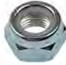
12MM NUT 54-61040 (2EA)