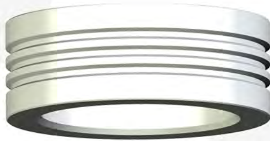
3" SPRING SPACER 79-16182 (4 EACH)