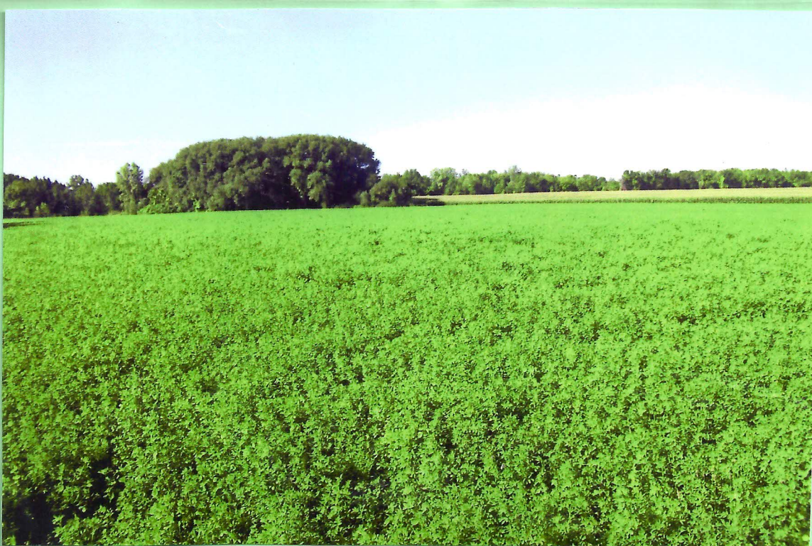
Top Photo: Alfalfa Kolbow Farms, Appleton, N.Y.

4 year stand ( tile drained ground) - 12# seeding rate