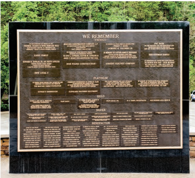
Cast Bronze Plaque on Polished Black Granite