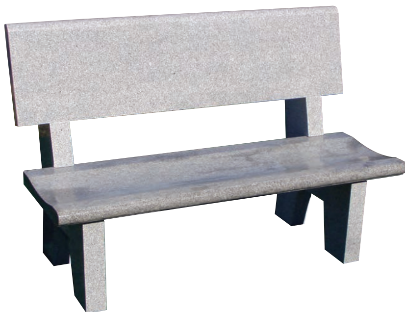
Granite Bench • Classic Park Design • Blue Pearl Color 48"L x 2.5"W x 46"H

Granite benches are attractive, durable and long-lasting additions to any building or park.