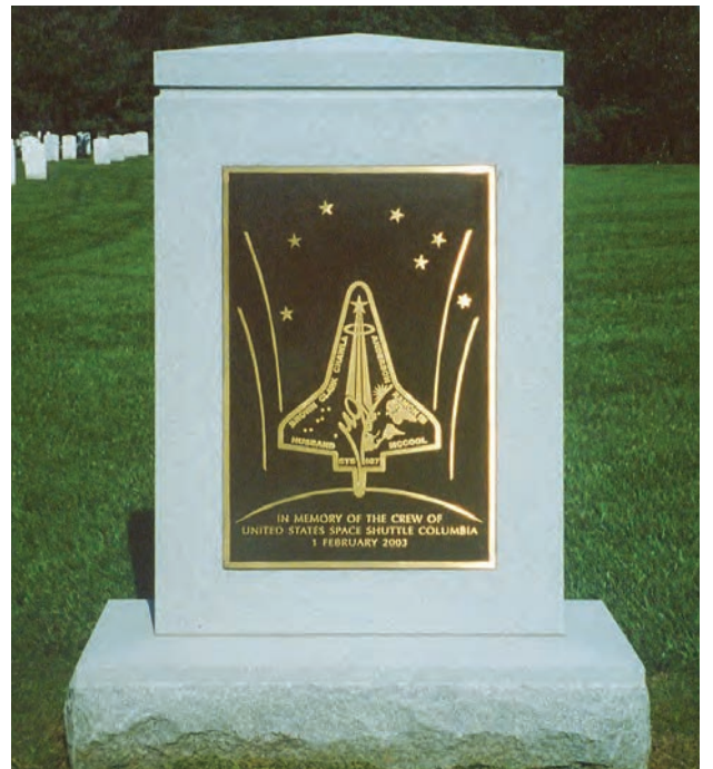
Cast Bronze Plaque on Everlasting Blue Granite Dark Oxide Background Color • Leatherette Texture Single Line Border • Diamond Shield® Coating