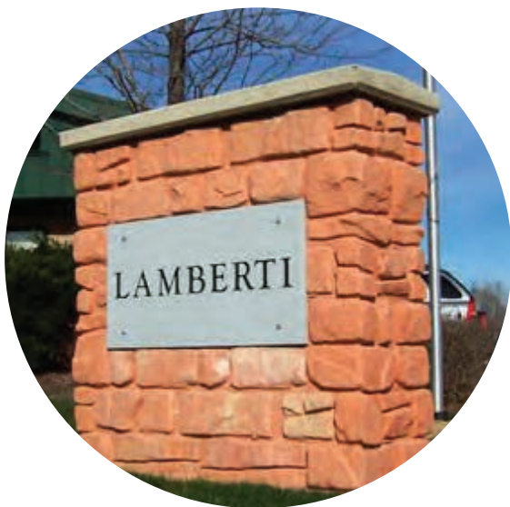
Granite Backer Panel • Polish Face • Balance Sawn

Applications include building identification or recognition of important figures or events.