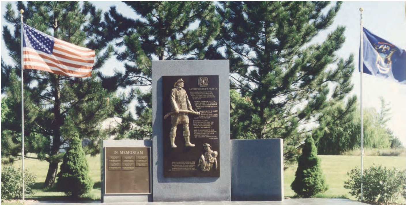
Bronze Plaque • Dark Oxide Background Color • Leatherette Texture Straight Edge • Diamond Shield® Coating • Everlasting Blue Granite

Used to identify companies and organizations, and to commemorate individuals and events.