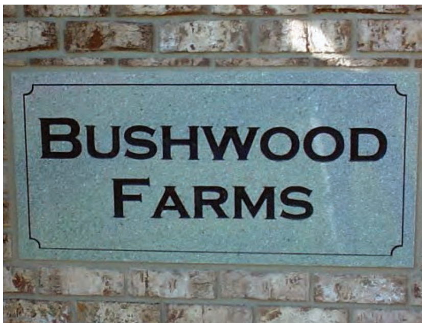
Granite Backer Panel • Polish Face • Balance Sawn