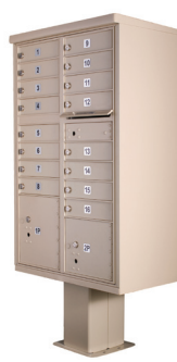
vigilant™ - 1565-16SDAF -