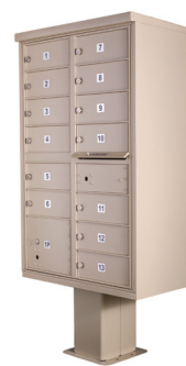
vigilant™ - 1565-13SDAF -