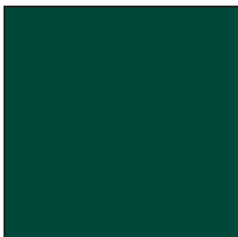
Forest Green (3308C) - Pebble Finish -