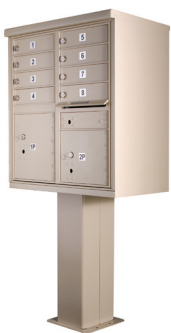
vigilant™ - 1565-8SDAF -