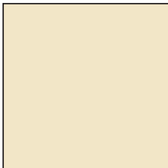
Sandstone (7501C) - Pebble Finish -