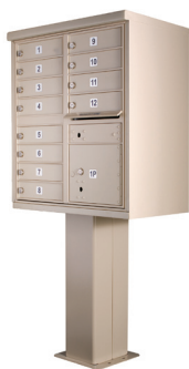
vigilant™ - 1565-12SDAF -