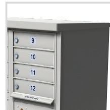
Postal Grey* (PG)