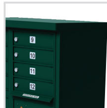
Forest Green (FG)