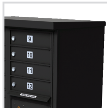
Dark Bronze (DB)