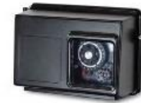
Fleck 2510 Light Commercial Timer