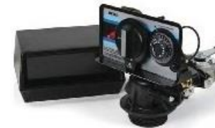
Fleck 5600 Timer