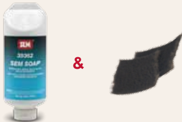
39362 SEM SOAP & gray scuff pads