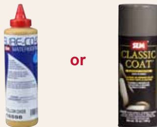
SURE-COAT™ or CLASSIC COAT™