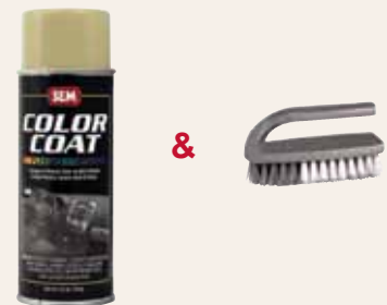
COLOR COAT & a nylon bristle brush