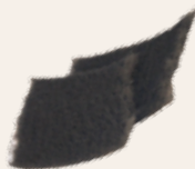
39362 SEM SOAP & gray scuff pads