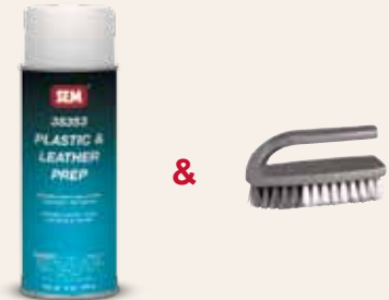
3835( ) PLASTIC & LEATHER PREP & a nylon bristle brush