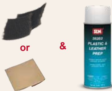
Gray scuff pads or 400-600 grit sandpaper & 3835( ) PLASTIC & LEATHER PREP.