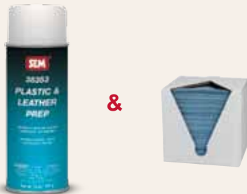
3835( ) PLASTIC & LEATHER PREP & lint free towels