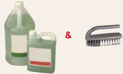
Upholstery shampoo or carpet shampoo & a nylon bristle brush