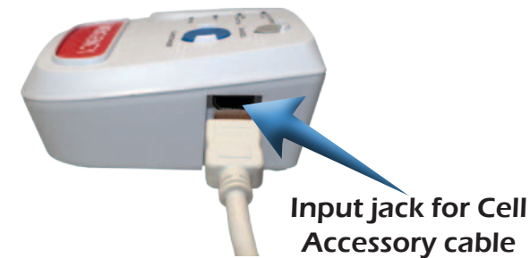
Input jack for Cell Accessory cable