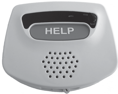
Emergency Wall Communicator Part #41920