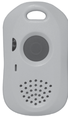
Additional Two-Way Pendants Part #41915