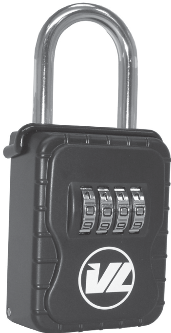
Lock Box Part #30913