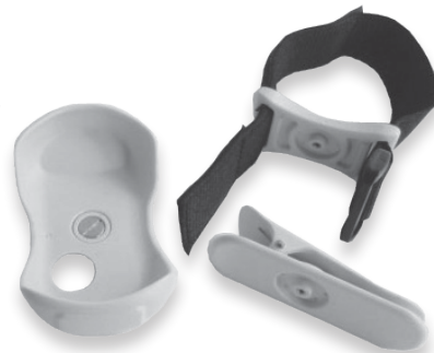
Wrist strap and Beltclip (Holster screws onto clip for beltclip or strap for wrist strap)