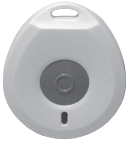
Pendant Part #40915

The items below are included with your System.