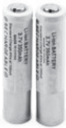
Rechargeable Li-Ion Batteries - 2 Pieces Part #35917