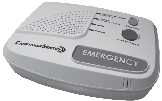
Base Unit Part #40914