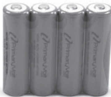
Rechargeable AA Batteries 4 Pieces Part #35918