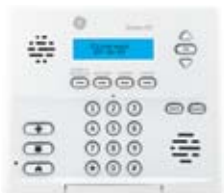
Simon XT™ Control Panel Compatible with Simon XT v1.3 or later.