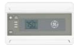
Wireless Thermostats Programmable HVAC control available through Z-Wave wireless thermostats.