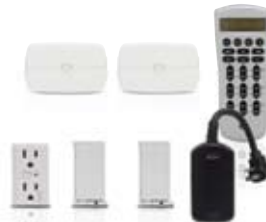
Wireless Lighting Control Integrated lighting control capability through Z-Wave® lighting control devices.