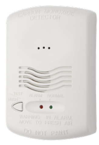
CO1224T Carbon Monoxide Detector