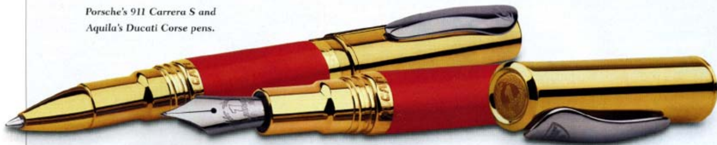
Porsche's 911 Carrera S and Aquila's Ducati Corse pens.