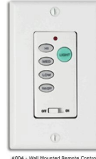
#004 - Wall Mounted Remote Control