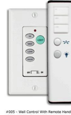
#005 - Wall Control With Remote Handset