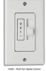
#009 - Multi-Fan Speed Control

Phone: 1-888-355-9525 Local: 1-207-985-3535 Fax: 1-207-985-4569