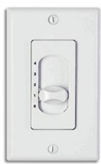
#001 - Fan Speed Control