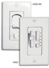
#002 - Three Wire Fan Speed and Light Control