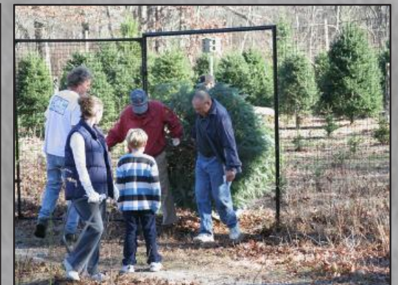
Meanwhile this young fox family is keeping things fun at Bedrock Tree Farm.