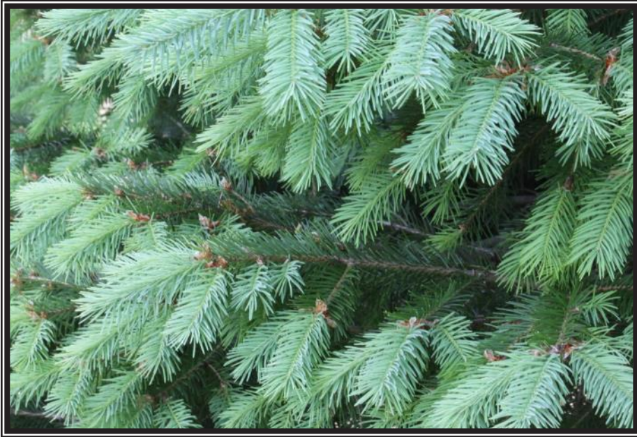
DOUGLAS FIR with new spring growth.

The Douglas Fir Needles lend the grapefruit scent to the mix while the Canaan Fir Needles have a potent tangerine scent.