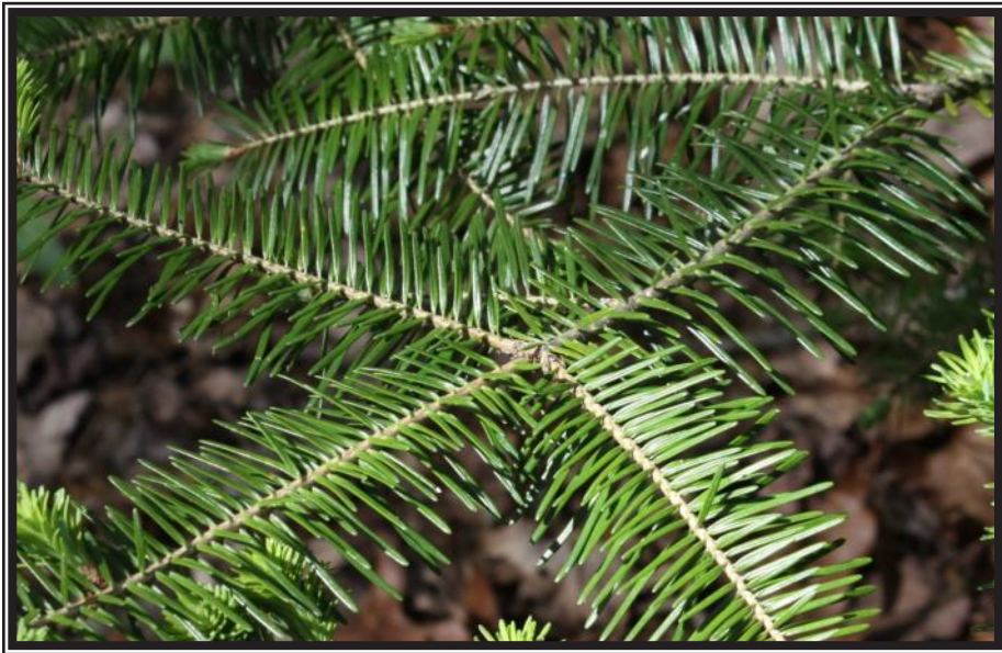
CANAAN FIR ( Balsam/Fraser Hybrid)

The Douglas Fir Needles lend the grapefruit scent to the mix while the Canaan Fir Needles have a potent tangerine scent.