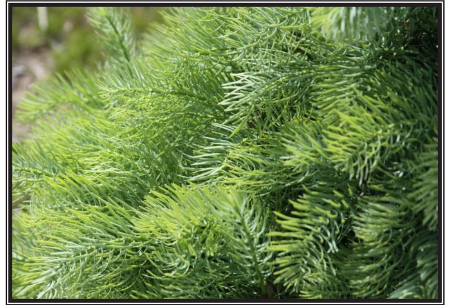
CONCOLOR FIR (White Fir)

The scent of the Concolor Fir needles is a very potent lemongrass scent and the Fraser Fir Needles add the apple note.