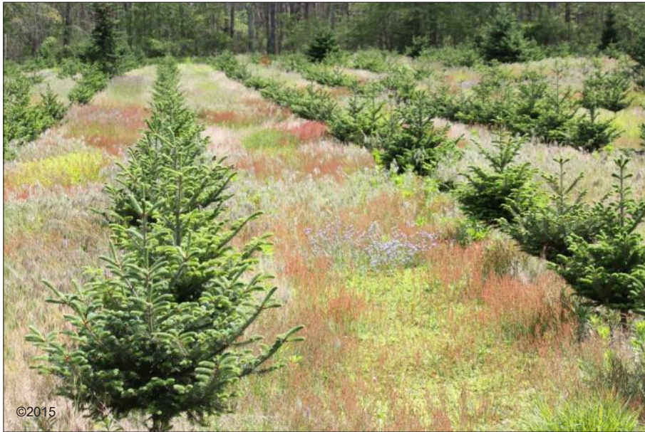
Bluebirds flock the back Fraser field on a warm summer day.