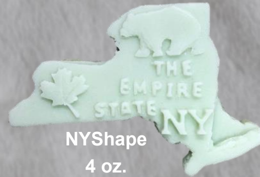
NYShape 4 oz.