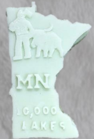
MNShape 4 oz.