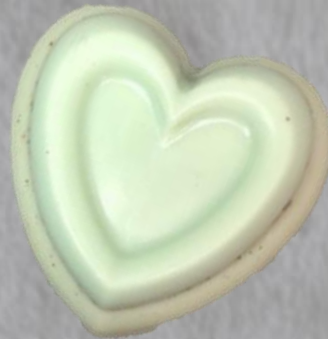
HEART SHAPED SOAP