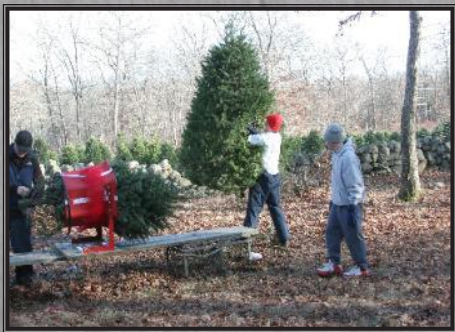
Human Tree-shaking machine.