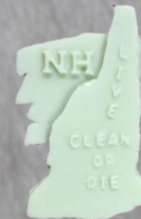
Brookdale Fruit Farm in NH. "Live CLEAN or die"