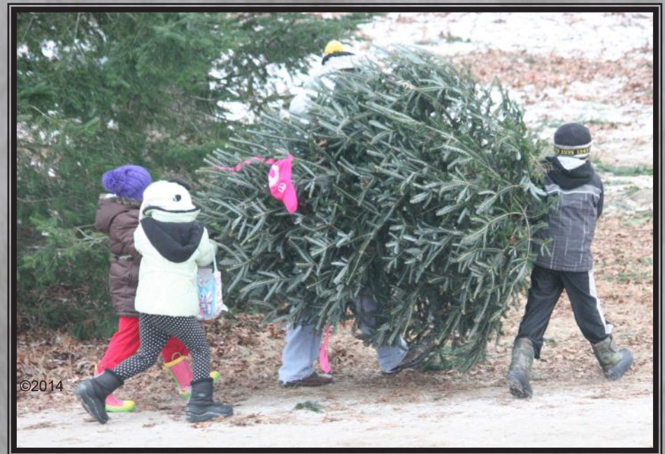
Many happy memories are made during our choose and cut Christmas season.