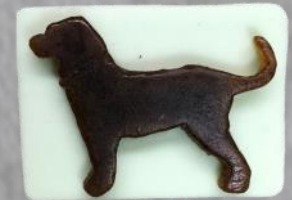
Soaps for The Black Dog Tavern